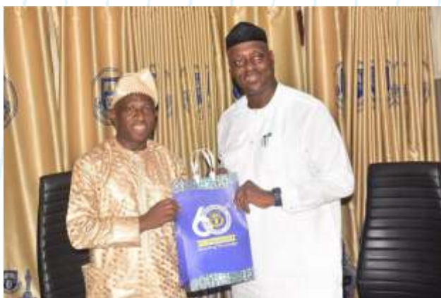
Courtesy Visit to the VC OAU, Ile-Ife