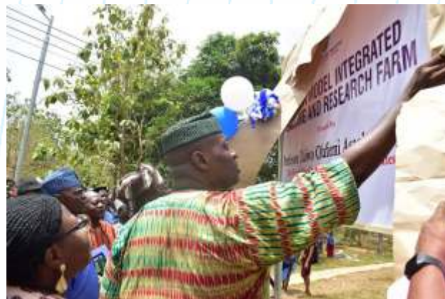
Official Commissioning of the Integrated Teaching and Research Farm