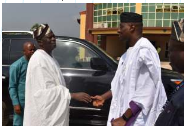
The Pro-Chancellor and The Vice-Chancellor