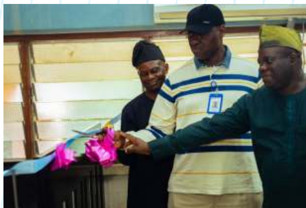
Commissioning of e-Library Solar PV solution at the University Library.