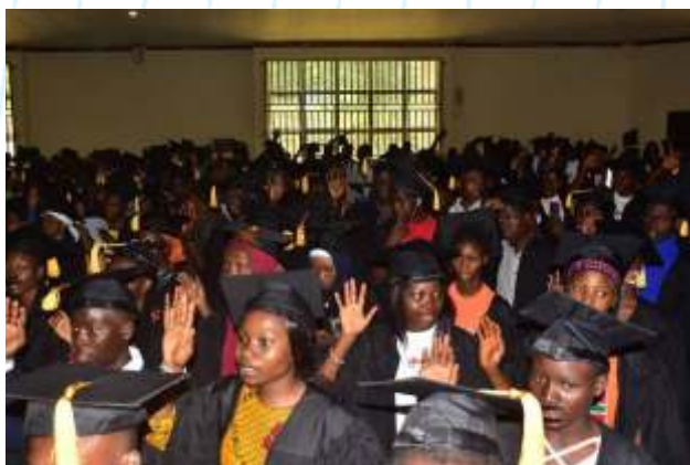
Matriculation of Pioneer Students