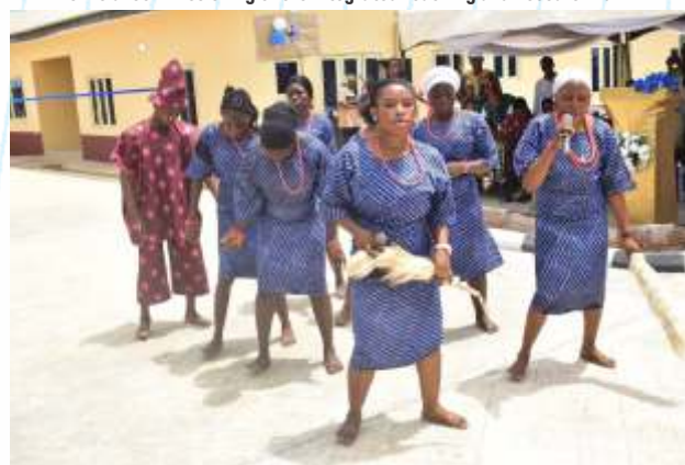
UNILESA Cultural Troupe