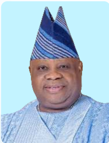
His Excellency, Sen. Ademola Jackson Nurudeen Adeleke Governor of Osun State