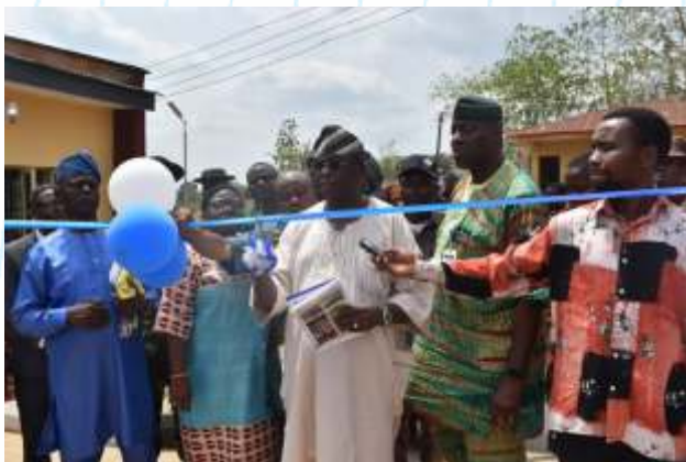
Official Commissioning of the Faculty of Law Buildings