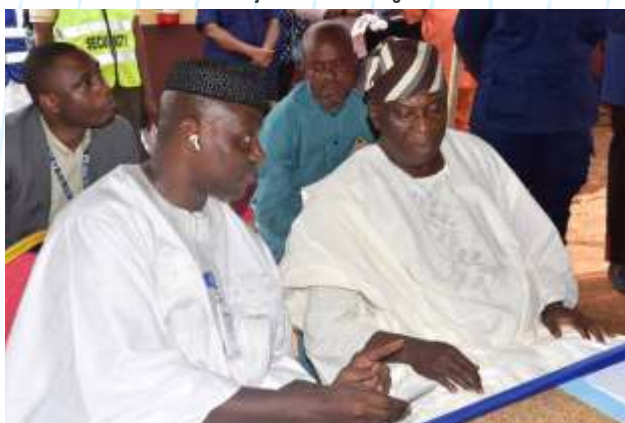
The Pro-Chancellor and The Vice-Chancellor