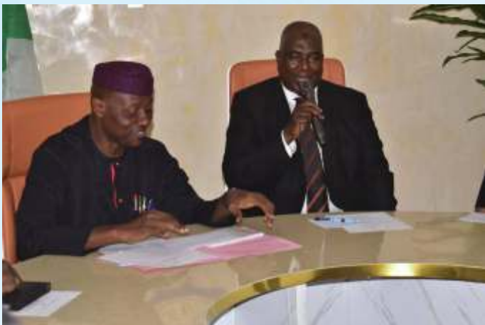
The Vice-Chancellor and the DG, CLE

The University has invested a lot in the establishment of a Faculty of Law, with provision of state of the arts resources, human and material, such as suitable and well-equipped Staff Offices, Moot Court, a dedicated Law Auditorium, a well-equipped Law Library, smartboards in all the lecture rooms, well-furnished seminar rooms, etc.